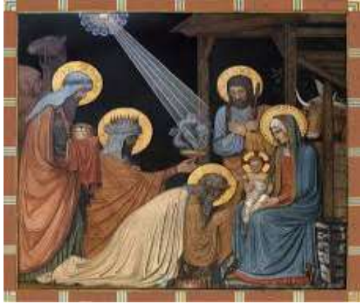
The Epiphany of Our Lord.