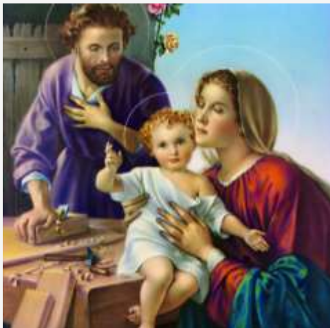
The Holy Family of Jesus, Mary and Joseph

Calendar note: Although the Solemnity of the Blessed Virgin Mary, Mother of God is January 1, 2024, because it falls on a Monday this year, it is not a holy day of obligation